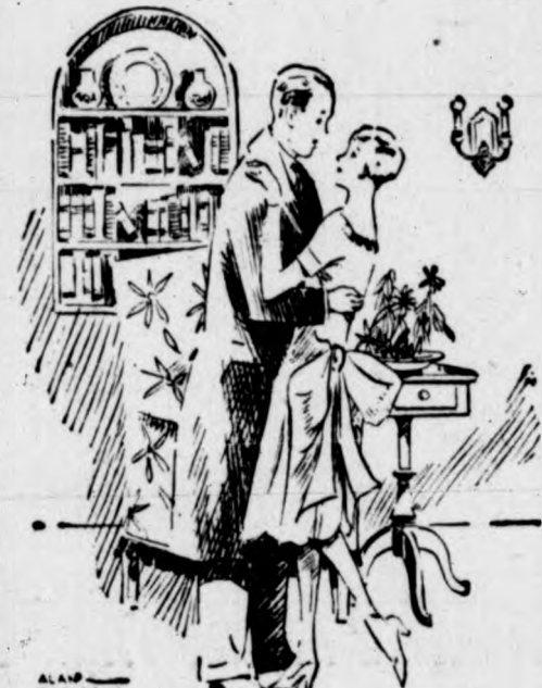
"How Did You Know I Would Still Be Waiting for You."