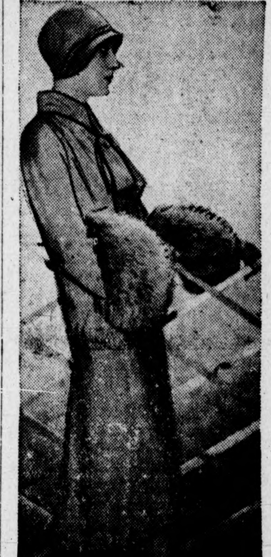
Tinted Gloves for Evening

Backs are Very Low seems to be camisole; but once over color of the gown.