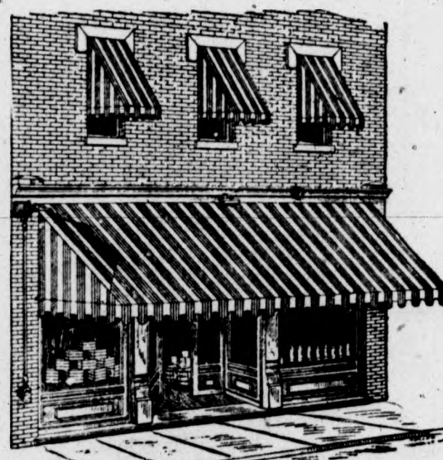
Tailor-Made Awnings For your porch. Makes your porch shady and cool.

SWINGS — AWNINGS — ROCKERS THEY ARE INEXPENSIVE, BEAUTIFUL AND COMFORTABLE.