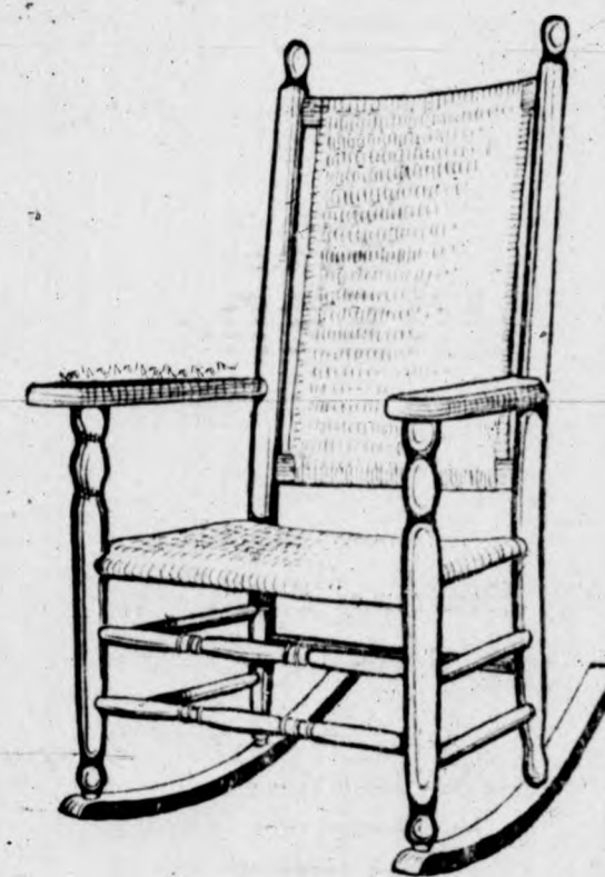
Solid Car-load Porch Rockers Special Prices.