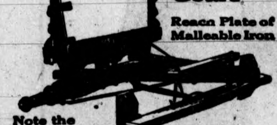
Note the Adjustable Brake Lever

The gears of Thornhill wagons stay in line for life. Instead of the usual front hound plate, hound plate of malleable iron is used. It is a metal jacket braced at eight points that keeps gears from ever getting out of line.