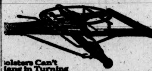
Bolsters Can't Hang In Turning

In turning and backing up, with the ordinary circle iron, which is only a half circle, bolsters run off the end of the track and hang. It is difficult to make short turns and rack up. The Thornhill full circle iron gives a continuous track on which the bolsters can turn.