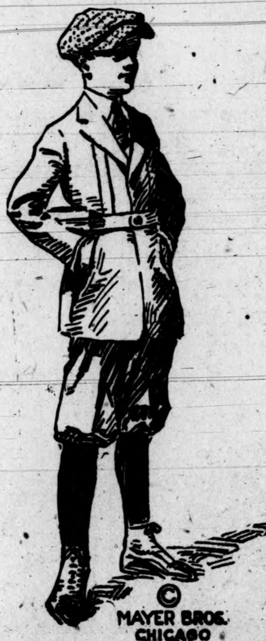
MAYER BROS. CHICAGO

Doesn't it stand to reason that Wearpledge and Woolly Boy Suits and Overcoats must be pretty carefully made from substantial materials when their maker can offer new clothes for old, if the new go old too fast? Think what positiveness must be behind the product that offers to pay, no matter how rough they play. Our Boys' Garments are absolutely GUARANTEED TO GIVE SATISFACTION