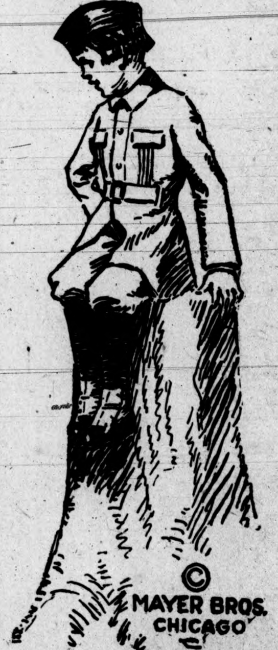
MAYER BROS. CHICAGO

You will always find our stock kept complete, fresh and up-to-date by Parcel Post. We are complete Outfitters to Boys.