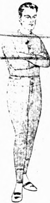
Heavy Ribbed Shirts and Drawers 88c

at a Big Bargain for Men, Women, Boys and Girls