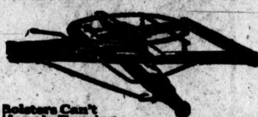
Bolsters Can't Hang in Turning

Full Circle Iron Malleable Front Houn Plate