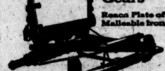
Note the Adjustable Brakes Lever

On the front bolsters of Thornhill wagons are heavy iron plates running along top and bottom—connected by rivets that run clear through the bolster. Strength and lightness are combined. Rear gears are strongly ironed. There are braces on both top and bottom that extend the full length of the hounds.