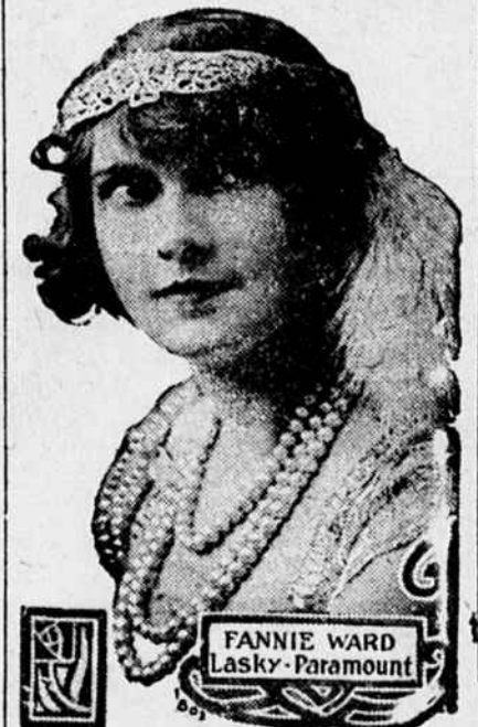
MAJESTIC TO-DAY in a Five-Part Drama, "Unconquered."

Brown-Knox Mercantile Co., Davidson, N. C.