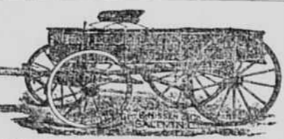
WINSTON-SALEM, N. C.