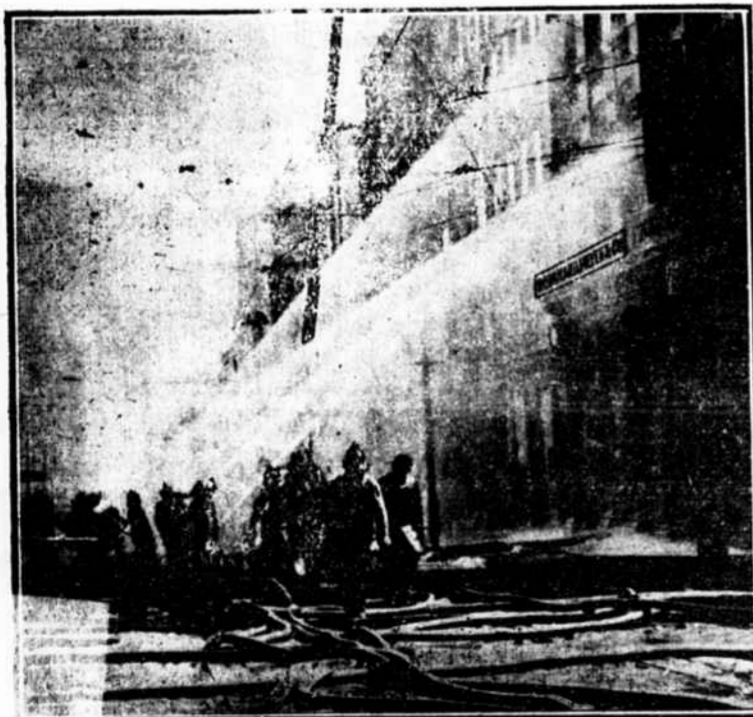
Scene during the big fire at Renihard Meyer & Co's store