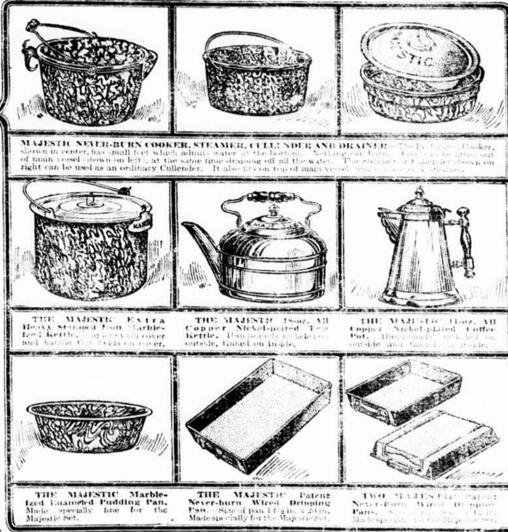
MAJESTIC NEVER-BURN COOKER, STEAMER, CULLENDER AND DRAINER —The Patented Cooker, shown in center, has small feet which admit water at the bottom. Nothing can burn. The steamer, shown on the left, and the cullender on right can be used as an ordinary Cullender. It also fits on top of main vessel, and is used as a steamer.