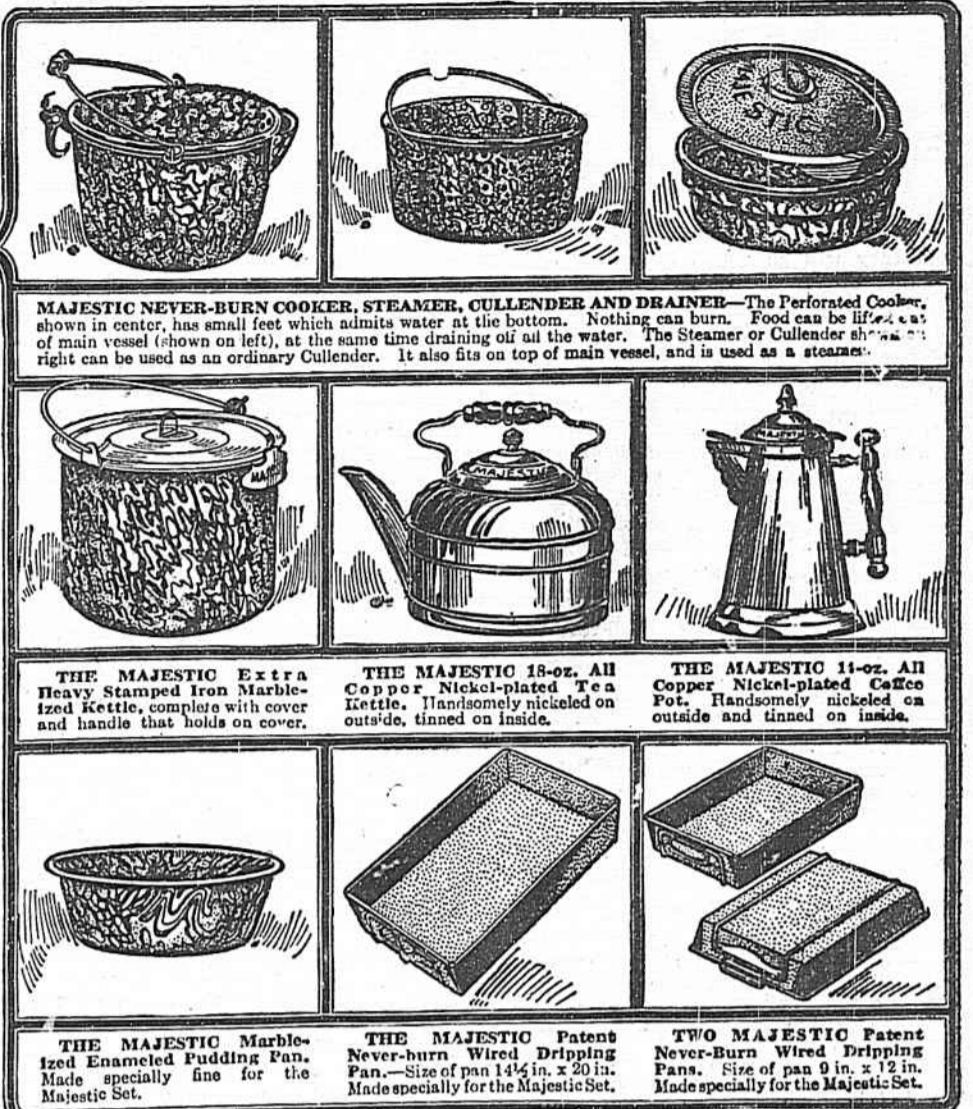
MAJESTIC NEVER-BURN COOKER, STEAMER, CULLENDER AND DRAINER —The Perforated Cooker, shown in center, has small feet which admit water at the bottom. Nothing can burn. Food can be lifted, and if of main vessel (shown on left), at the same time draining off all the water. The Steamer or Cullender shown on right can be used as an ordinary Cullender. It also fits on top of main vessel, and is used as a steamer. THE MAJESTIC Extra Heavy Stamped Iron Marbled Kettle , complete with cover and handle that holds on cover. THE MAJESTIC 18-oz. All Copper Nickel-plated Tea Kettle , handsomely nickel-plated outside, lined on inside. THE MAJESTIC 11-oz. All Copper Nickel-plated Coffee Pot , handsomely nickel-plated outside and tinned on inside. THE MAJESTIC Marbled Enamel Pudding Pan . Made especially fine for the Majestic Set. THE MAJESTIC Patent Never-burn Wired Dripping Pan .—Size of pan 13 1/2 in. x 20 in. Made specially for the Majestic Set. TWO MAJESTIC Patent Never-Burn Wired Dripping Pans . Size of pan 9 in. x 12 in. Made specially for the Majestic Set.

THE GREAT AND GRAND MAJESTIC RANGE THE RANGE WITH A REPUTATION MADE IN ALL SIZES AND STYLES.