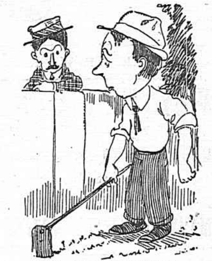
THE GARDEN'S BENEFIT. "Your garden must be a source of great pleasure." "Well, it makes me more calm and philosophical. When I see how hard it is to grow things I don't feel so indignant at the prices charged by the store."