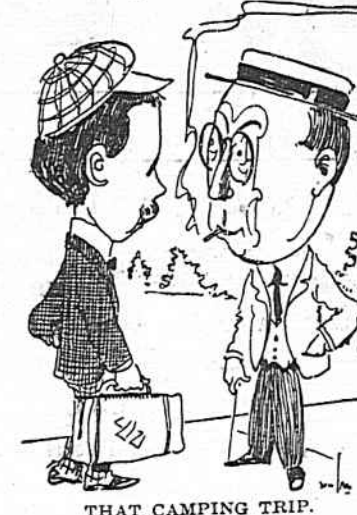
THAT CAMPING TRIP. "Have good weather on your camping trip?" "You bet!" "There were enough sunny days to dry out all the bed clothes before the next rain came."