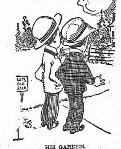
HIS GARDEN. "How's he getting along with his garden?" "Splendidly. He picked one tomato out of it yesterday."