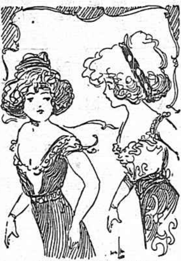
SHORT ON CURRENCY. "Did she marry the man who rescued her?" "Yes, and now she's discovered that her life was the only thing he ever saved."