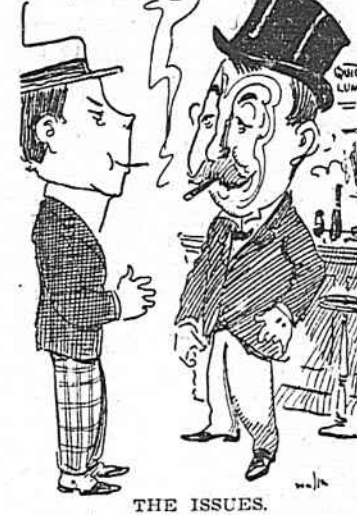
THE ISSUES. "What are the issues of the campaign?" "Well, we haven't issued anything yet, but a loud call for money."