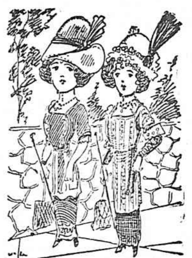
RIGHT AWAY. "I understand Mrs. Bangs knows all the details of that latest divorce scandal."

"Oh! you needn't bother—yes, it's hot enough for me."