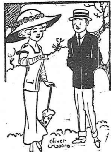
DIFFERENT LINE. Mr. De Wealth—I am leaving town for my health.

Miss Seeker—Do you always take your doctor's advice? Mr. De Wealth—This was my lawyer's advice.