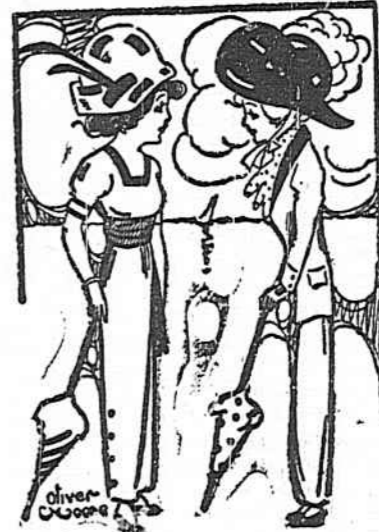
SLIM. "Isn't she slim?"

"Slim? I should say she is. Why, she could actually do a high kick dance in a hobble skirt."