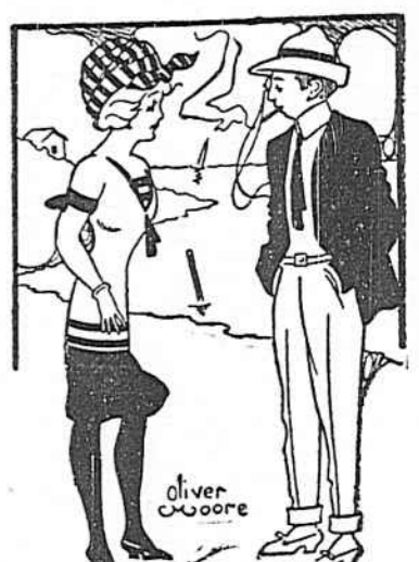
EVIDENTLY NOT. "Does he think much of her?"

Miss Seeker—Do you always take your doctor's advice? Mr. De Wealth—This was my lawyer's advice.