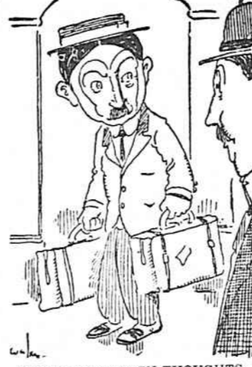
AFTER THE BEACH THOUGHTS. "Homeward bound, eh?"

"I don't think so. I saw him change places with her in a canoe this morning on the lake."