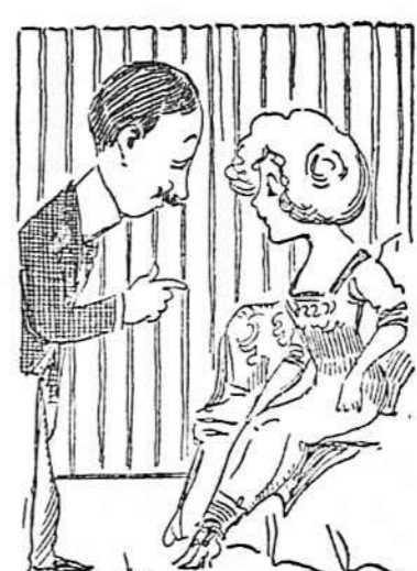
POSTED. "I am going to ask you the old, old question."

"Yes." "You seem thoughtful. Thinking about the girl you left at the beach?" "No, I was thinking about those 200 plunks."