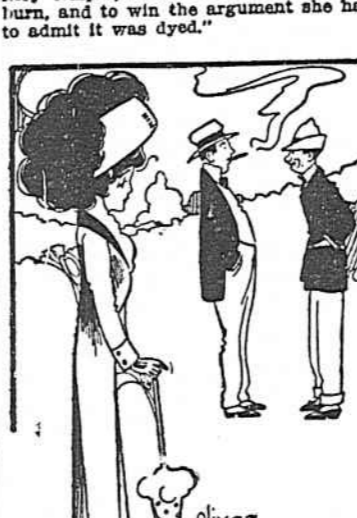
MIDSUMMER BARGAINS. "What are your wife's worst extravagances?"

"No." "Why not?" "I went on a straw ride once."