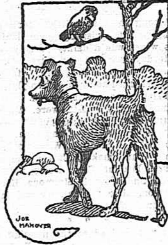
COMPLIMENTS. The Dog—I'm happy as a lark; how are you? The Bird—I'm sick as a dog.