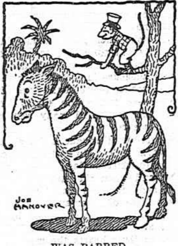
WAS BARRED. Monk—What's up, Zeb? Wouldn't they enter you for the races? Zeb—Nope. Told me I was barred.