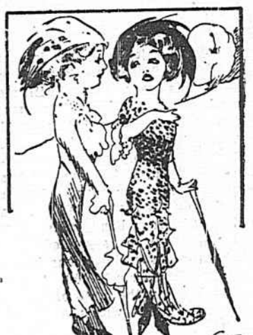
HIGH ROLLERS. "Do you and your husband belong to any clubs?" "Oh! yes; he is a member of the 'Always Next' Pressing Club, and I belong to three soap-premium societies."