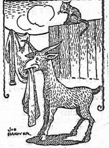
CONSISTENT. The Cat—Hey, you crooked-horsed skate! What do you mean by chewing up my mistress's gown? The Goat—Can't you see it's a dinner gown? That's why I'm eatin' it.