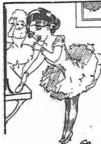
BEHIND THE SCENE. "That handsome poet said he was going to write a sonnet on my eyelashes." "I hope he uses ink. They have been penciled too much already."