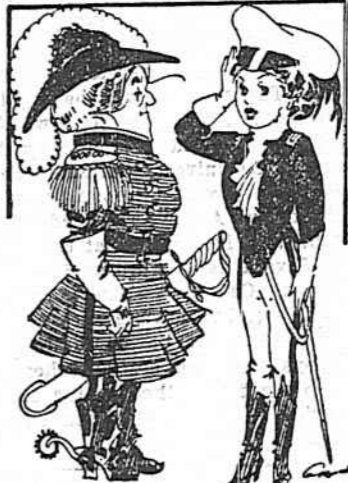
WHEN WOMEN VOTE. The Colonel—Why did you refuse that promotion? The service is better, the pay is more and the rank is higher. The Captain—I know all that but the uniform looks hideous with my complexion.