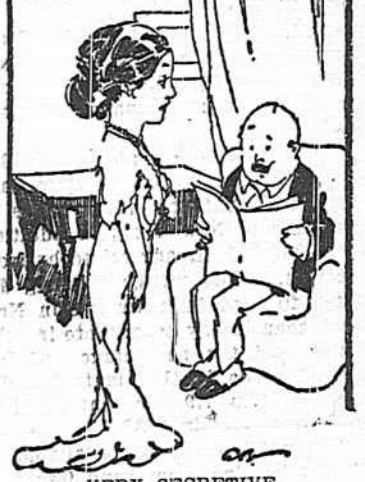
VERY SECRETIVE. Mrs. Pester—Who says a woman can't keep a secret? Mr. Pester—Not me. There are several things a woman won't give up. For instance, her age, and where she gets her hair.