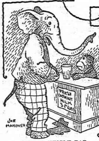
AT THE JUNGLE BAR. Bartender Monk—Confound these pure food laws! Jolly Jumbo—What's the trouble now? Bartender Monk—Why, old Hippo was in here a while ago and wanted proofs that the milk in our cocoanuts was pasteurized and sterilized.