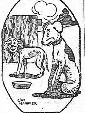
OUTCLASSED. First Dog—The bulldog broke up the bench show last night. Second Dog—What was the trouble? First Dog—His pup got the tooby prize in the beauty contest.