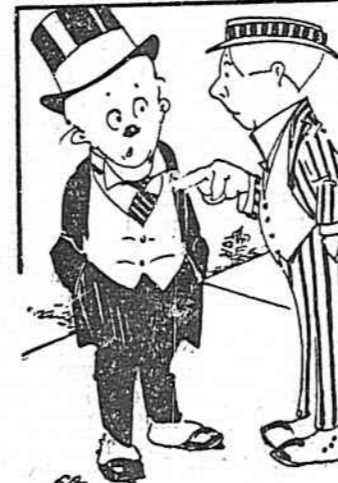
HARD TO PLEASE. Old Mr. Batch—What are you worrying about? Young Mr. Nubridge—A little question that came up at home. My wife wants to know if I'd marry again in case of her death, and if I say "certainly not" and if I say "sure thing" she'll think I have her successor picked out.