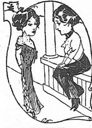
HER SCORE. "What did you go around the links in?" "Wh! just a plain blue skirt and white shirtwaist."