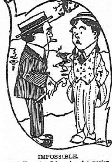
IMPOSSIBLE. First Chappie—I have had a notion—aw—to drown myself, old chap, doncher know. Second Chappie—Oh! dear boy, you mustn't! You know how—aw—these beastly flannel suits shwink when wet.