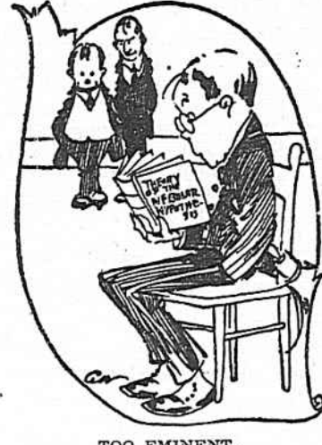
TOO EMINENT. "Why don't you ask your office boy to wash those windows?" "I ain't got the nerve to do it, old man. He was the valedictorian of his class."