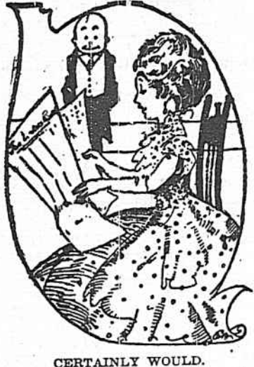
CERTAINLY WOULD. Wife—This morning's paper tells about a man with 18 wives. Hubby—Well, he could organize them into two baseball teams and then, if they played games enough, they would be able to support him nicely.