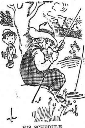
HIS SCHEDULE. "Hey, mister, do ye fish all the time?" "Yes; most of the time, sonny." "What do you do when you ain't fishing?" "Sleep." "An' when you don't sleep?" "Fish!"