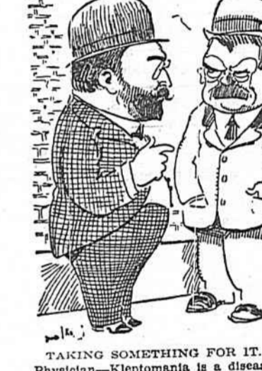
TAKING SOMETHING FOR IT. Physician—Kleptomaniacs is a disease. Detective—I guess that's right. I've noticed that its victims are always taking something for it.