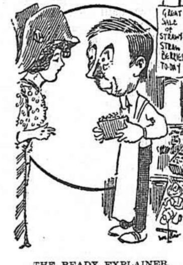
THE READY EXPLAINER. Customer—Why do you put so many little berries under the top layer of big ones? Grocer—That is done so that we can get more of them into a box.