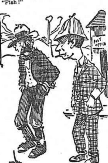
IN SEARCH OF SPORT. The Tourist—Can a man shoot any small game around here? The Native—Over at the livery stable they'll shoot you some craps for a nickel.