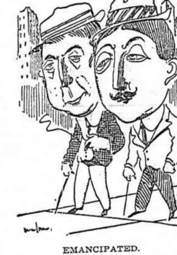
EMANCIPATED. "Does your wife want to vote?" "She doesn't know." "Why doesn't she know?" "I haven't told her yet."