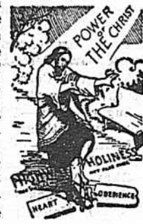
A "strange child" stricken.

In our lesson the Prophet David pictures the holy, happy, blessed nation of the Lord. It is a picture of the future and not of the past. It is an ideal picture. It will be realized when Messiah's Kingdom shall have been established amongst men—when Satan's power shall be restrained, when he shall be bound, when the blessings of Restitution shall have uplifted mankind from sin and degradation and shall have brought them back to the image and likeness of God lost in Eden, but reacquired for our race through the sacrifice on Calvary.