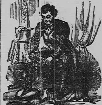
BULTMAN & BROTHER, MAIN STREET, SUMTER, S. C.

THE Cheap Cashshoe Store Has just Received the Largest and most complete stock of BOOTS AND SHOES