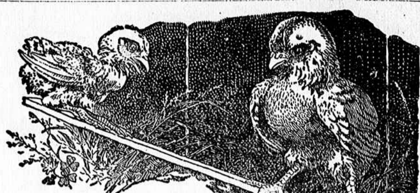
"Copyright 1921, Purina Mills"