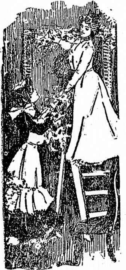
DECORATING THE HOUSE.

Two wrongs may not make one right, but it makes them both write, if they occur between two editors or correspondents.