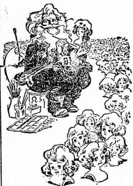
He prepares to make glad the hearts of good little girls.