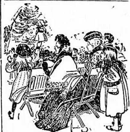
"POLLY SCREAMED WITH DELIGHT OVER THE BIG DOLL."

"Come along, my dear," said Miss Church, heartily. "The oftener the