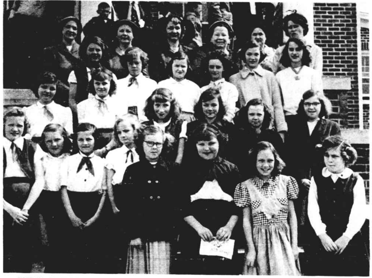
THESE ATTRACTIVE YOUNG LADIES are the members and leaders of the Lydia Campfire Girls which recently engaged in a week of special activities as a part of the national observance of the 43rd anniversary of Girl Scouting in the United States. Leaders of the Lydia Campfire organization are pictured on the back row.

Special Easter music featured services at Calvary Baptist Church during both the morning and evening ser-