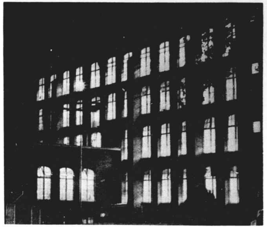
This is the Clinton No. 2 plant as it appears at midnight.