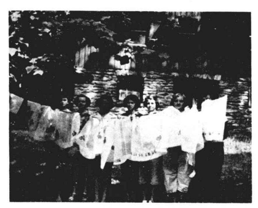
TEXTILE PAINTING was one of the crafts taught at Buck Horn and this group is shown displaying some aprons they handpainted.