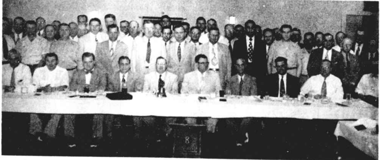
MEMBERS OF THE CLINTON KIWANIS CLUB were taken on an inspection tour of the Lydia Mill May 22, many of them on their first visit to a textile mill. Before the tour, 15 representatives of Lydia were guests of the club at an Appreciation Dinner held at the Mary Musgrove Hotel. The dinner