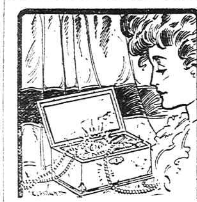
A Great Fascination

clings to the jeweler's windows. All Board of Education within many of the masculine element who have the time. It is argeed by all.