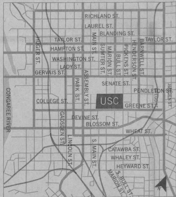
These reports are taken directly from the USC Police Department.