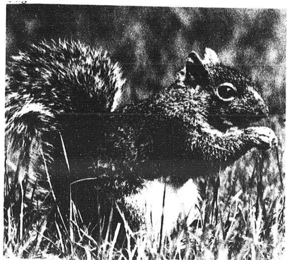
What do you mean the price of nuts is going up? I heard there is an abundance of them at the White House. Gamecock Photo by Russ Jeffcoat.