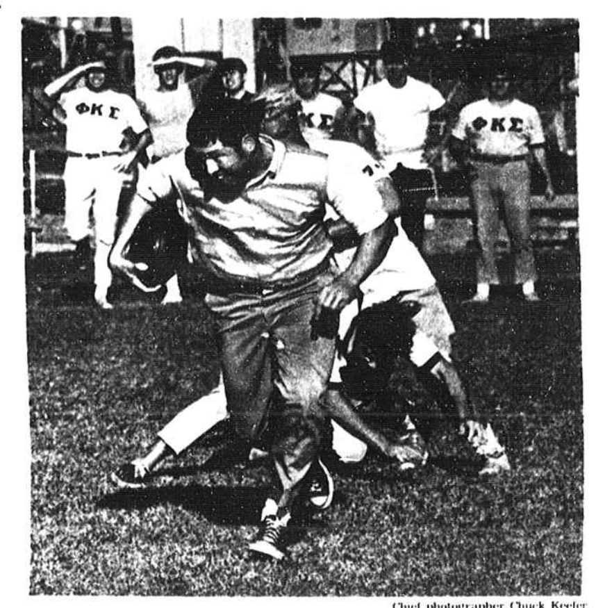
Grounding out yardage

But try to convince the Carolina student body of this. As far as they're concerned, the Gamecocks had better start worrying about room accomodations up in College Park.