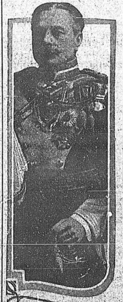
General Sir Douglas Haig.

Hailed as the "man of the hour," General Sir Douglas Haig succeeded Sir John French as commander of the army in France and Flanders on Dec. 16th. General Haig is only 43, four years old, the youngest commander in the present war. He is a Scotsman, born in Fifeshire, is tall, powerfully built, dour and masterful, and so close a student of his profession that he was nicknamed "von Haig" by his friends.