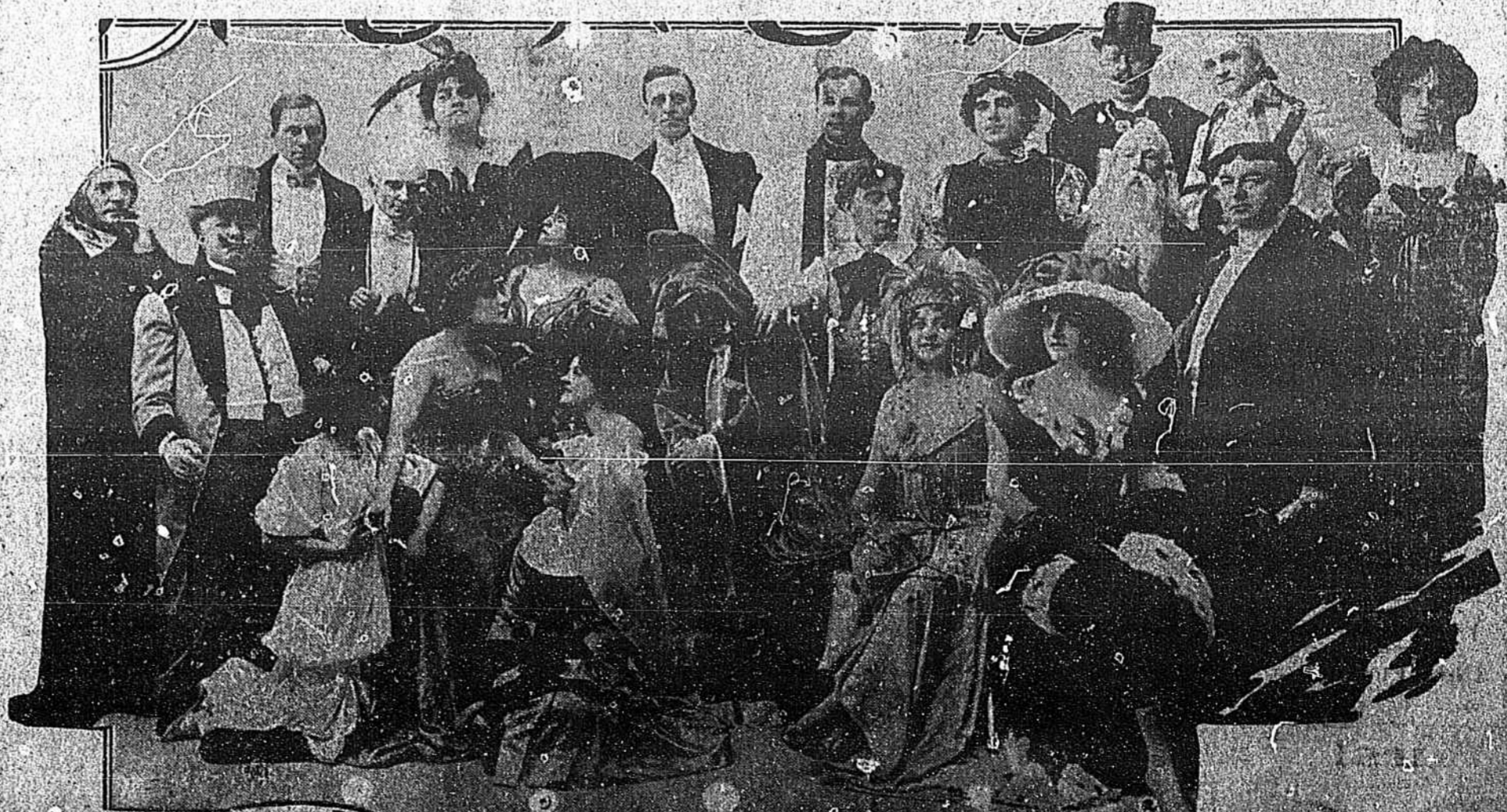
Principal Characters in "EVERYWOMAN" at Anderson Theatre, Wednesday, December 29