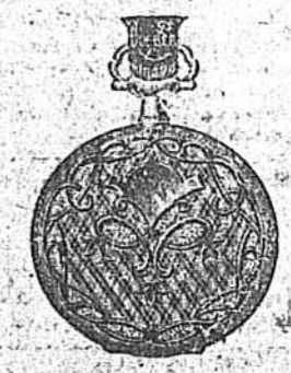
7 Jewel Elgin Watch in 20 year Case, Monday, only... $7.50

These are genuine perfect cut, blue-white diamonds, snappy and brilliant. Our liberal exchange system enables you to trade in any of these at full value on the price of a larger diamond.