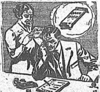
Debt a Hard Master