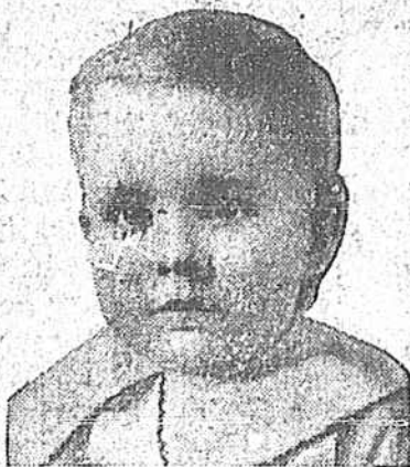
HARLEY BUREN BULLS

Mild Laxative Compound Corrects Stubborn Case of Constipation.