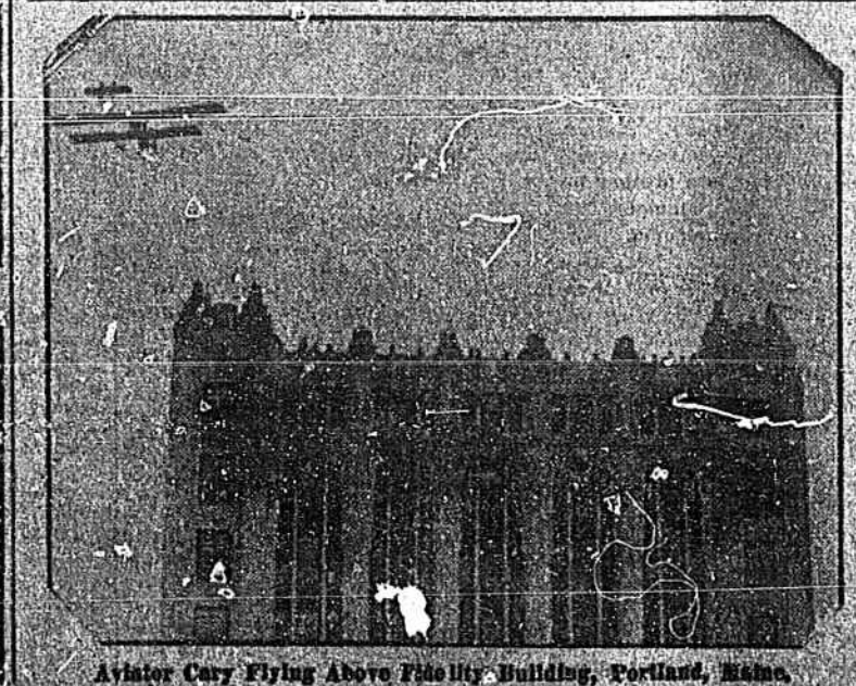
Aviator Cary Flying Above Fidelity Building, Portland, Maine.