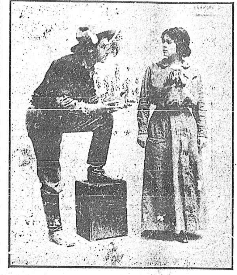
Scene From the "Winning of Barbara Worth," Anderson Theatre, Matines, and Night, Wednesday, November 3.

WE ARE PAYING $40 per ton for cotton seed and selling hulls at twelve dollars per ton; coal $4 to $5 per ton. These prices at our yards. Martin Coal & Wood Co.