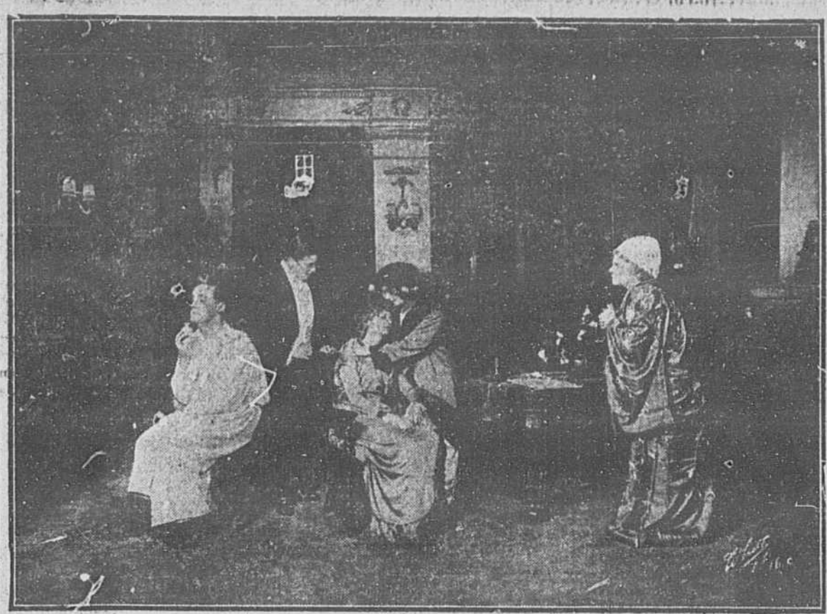
"PEG O' MY HEART" At The Anderson Theatre for One Night Only.

On Friday night the local theatre-goers will have the opportunity of seeing "Peg O' My Heart," Oliver Morosco's production of J. Hartley Manner's greatest comedy, which Laurette Taylor played in New York for two years. The scenes of the play are laid in a small town in England, Scarborough, the home of the Chichesters. They are a proud, unnatural family, and have accepted the responsibility of educating Peg, an unknown niece, for