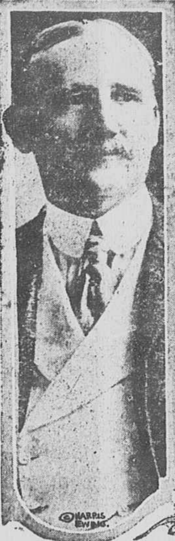
WILLIAM W. RUSSELL, Minister to San Domingo.

William W. Russell, who got out of his place as minister to San Domingo to make room for "Big Jim" Sullivan, is going back to that country in the same position to take the place of the man whom he had to make room for.