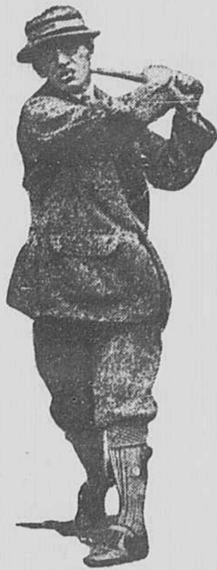
Walter J. Travis.

Walter J. Travis, aged fifty-three, showed a crowd of young golfers what he could do at his age when he won the Metropolitan championship on Long Island against a field of men of national renown in the game.